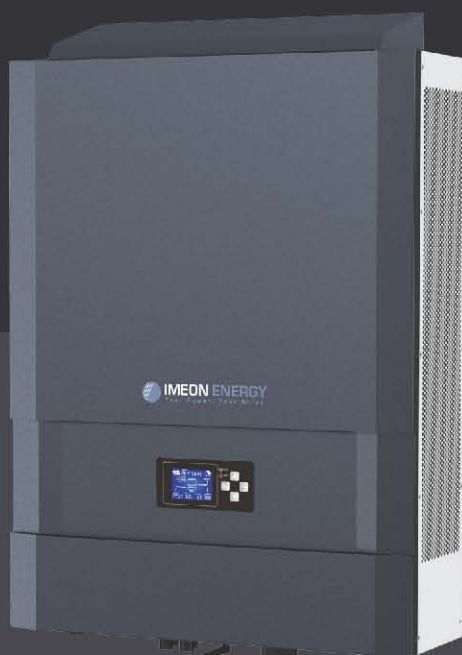
IMEON 9.12 Up to 12kWp Three phase