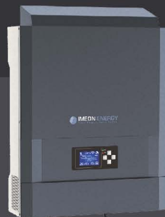
IMEON 3.6 Up to 4kWp Single phase